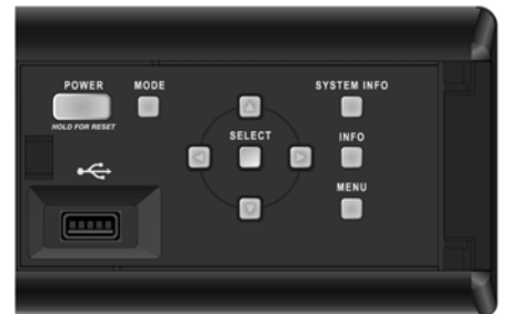
Behind Right-Side Door